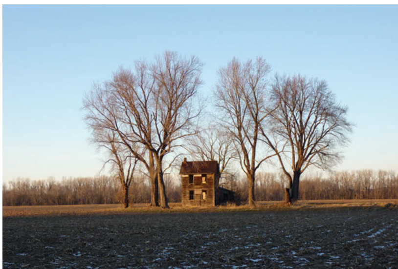
Jesus, hollow and plastic, stands unmoved.