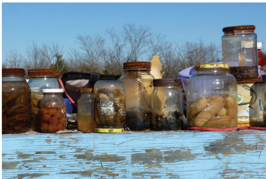
The excrescences of that great garden of arcana.