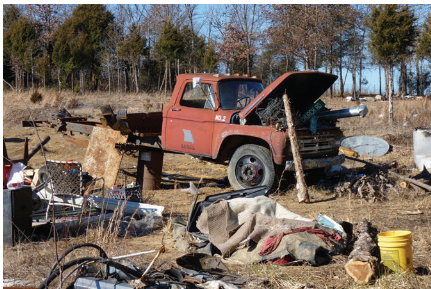
Occulted ways of mattering in a late industrial landscape.