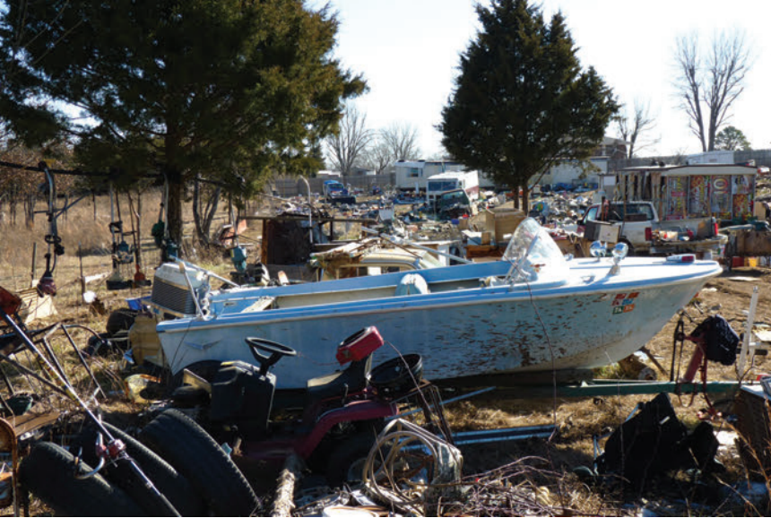
My Fata Morgana.

And beyond the edge of town where the humming motors fade into the hush-hush of the cottonwoods there irrupts all at once . . . abundance!