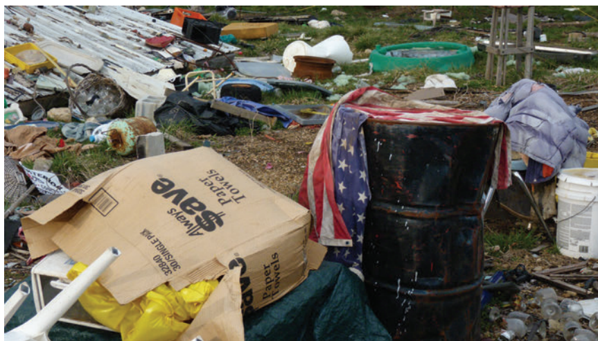
The leavings of late industrialism and a gluttonous accumulation of concepts.

Holding tight with lattice force, the yellowish crystals keep to their crooked line, the one line remaining. My seeking system. When I look for meth, I don't pick my way through the ruins of uneven geographic development, rogue industry, dysregulated consumption, despoilation, and dispossession only to tell an allegorical tale, and certainly not one that makes theory its privileged register and words its privileged marks. 52