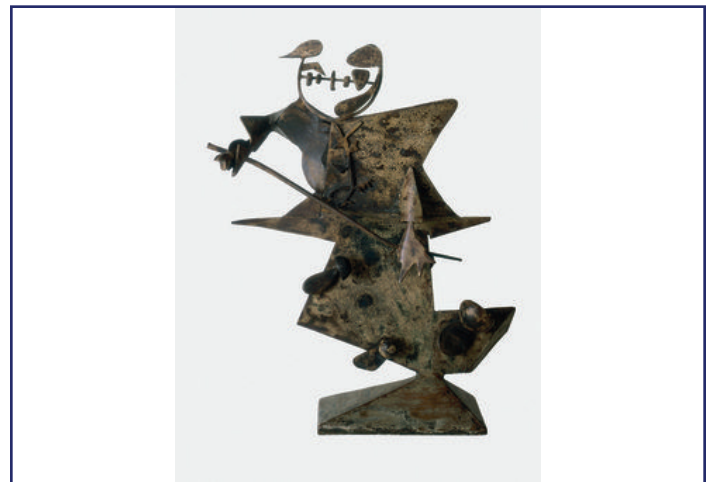
David Smith, Billiard Player III , 1945. Welded, painted, and patinated steel, Collection Neuberger Museum of Art, Purchase College, State University of New York, Gift of Roy R. Neuberger, 1974.22.16.